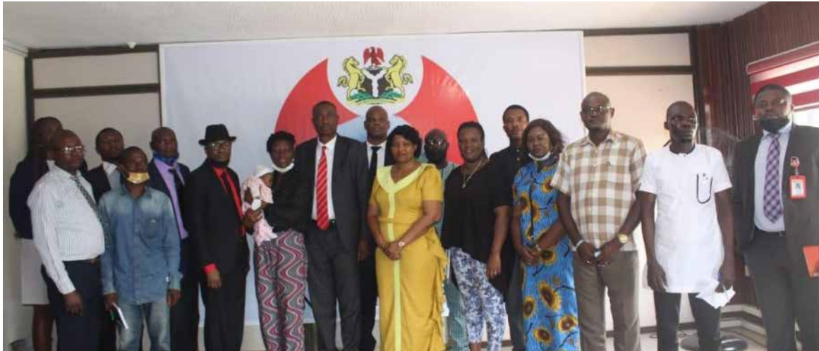
SNC Edo state anticorruption network with the Head, Benin Zonal Command of the EFCC