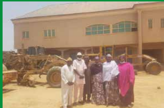
During the network's Intervention