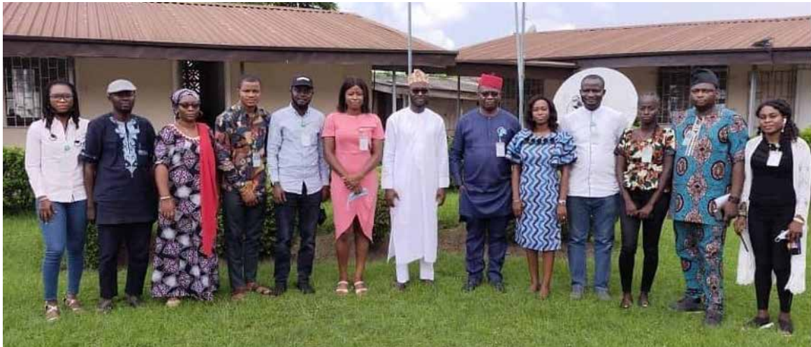
SNC Anticorruption network in Lagos state, with ICPC State Resident Anticorruption Commissioner, Mr. Kabiru Elelu.