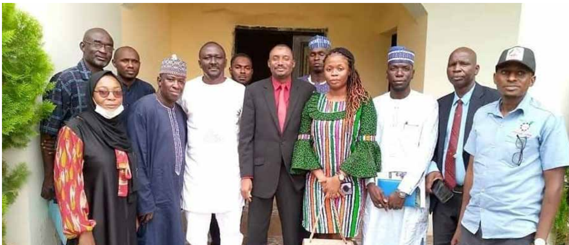
SNC Anticorruption network in Kano state with ICPC state commissioner, Barr. Ibrahim Garba-Kagara