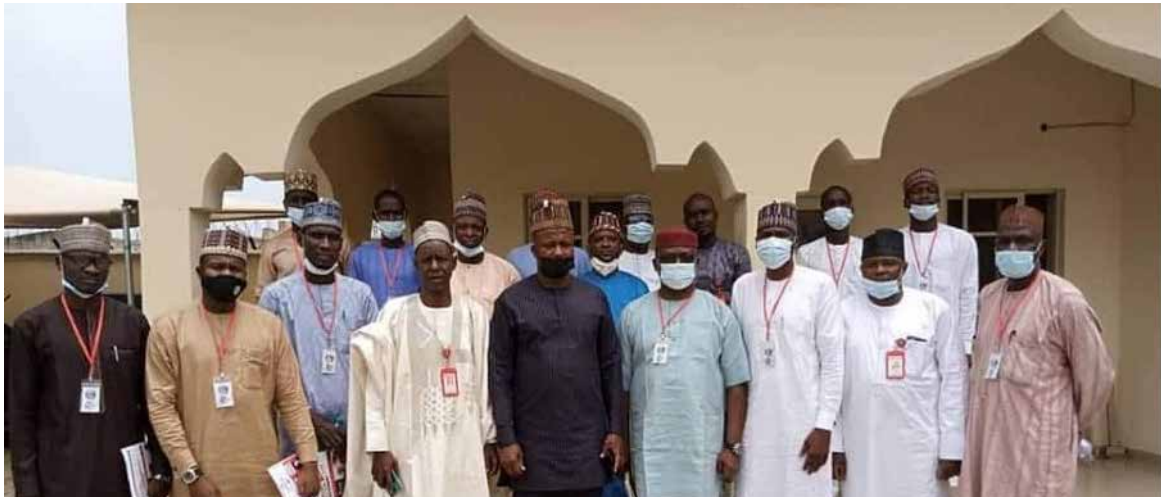
SNC Anticorruption network in Borno State with zonal commander of the EFCC, Onwukwe C. Obiora